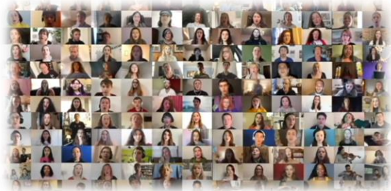
Above: Virtual Choir / Orchestra performing "You'll Never Walk Alone" from Carousel

In this edition of The Vine , we once again share with you, songs that instil in us faith, hope and courage during times of trial.